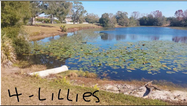
4 - LILLIES