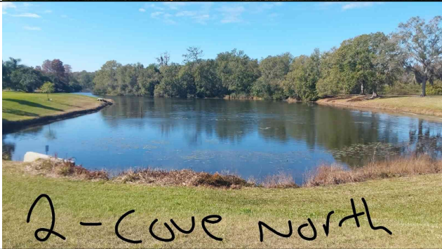
2 - Cove North