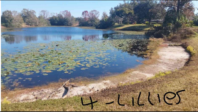
4 - LILLIES